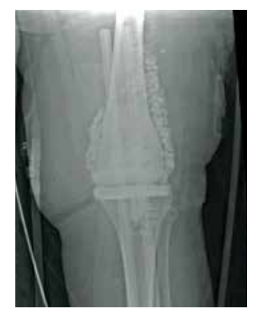
TRANSFORM INFECTED REVISION ARTHROPLASTY <sup>4</sup>

Discover the true potential at biocomposites.com